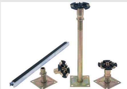
Zinc Passivated Steel adjustable Understructure for heights from 50mm to 1500mm