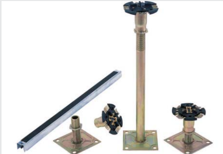
Zinc Passivated Steel adjustable Understructure for heights from 50mm to 1500mm